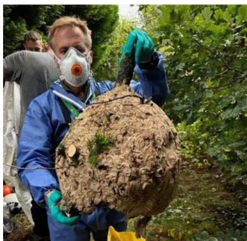
The Southampton nest.

We're now at the end of the yellow-legged hornet's annual lifecycle. Any mated queens that escaped the net will have either found a place to hibernate or will have died from exposure; there have been one or two cold nights in recent weeks.