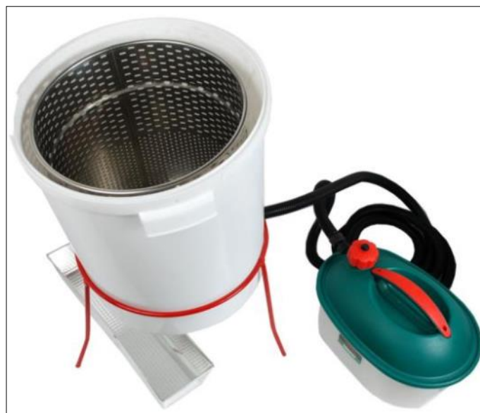
Abelo steam wax melter