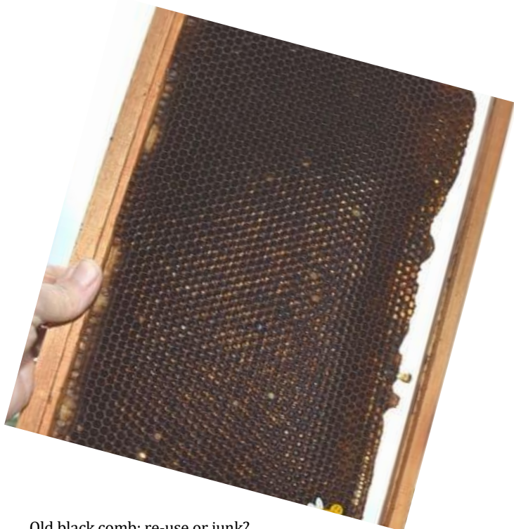
Old black comb: re-use or junk?