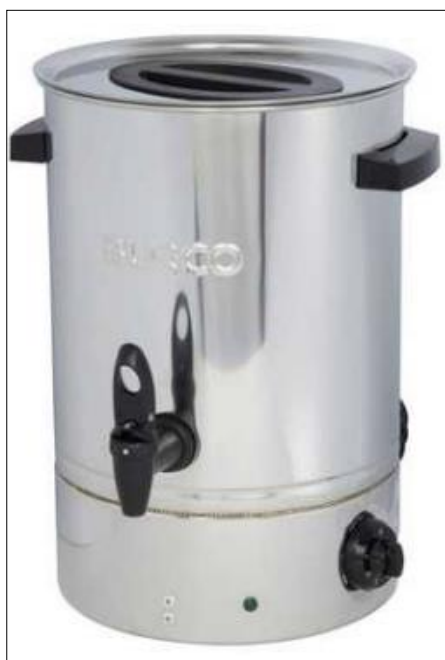
10-litre boiler: ideal for frame cleaning

However, if you want to make really clean wax for showing, making wax wraps, cosmetics or candles, then repeat the melting process two or three times and instead of scraping the resulting rubbish off, strain the wax through fine material (eg old tights, pillowcases or muslin) each time to remove any impurities.