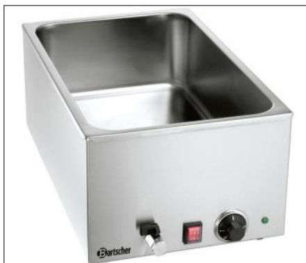
A bain marie makes a good wax melter. Just don't cook anything in it afterwards! Commercial version above left, DIY (bought second-hand) above right.

You can make your own. My melter works on the same principle as the commercial version, but it's way cheaper, essentially using components